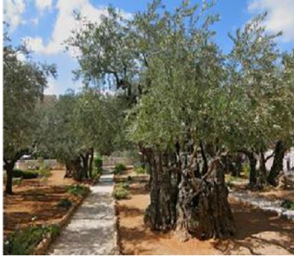
Garden of Gethsemane