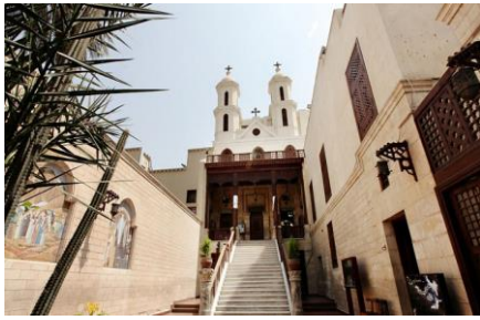
Church of AL MUALLAQA