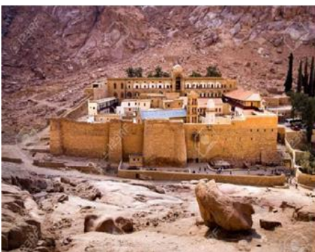
St. Katherine Monastery