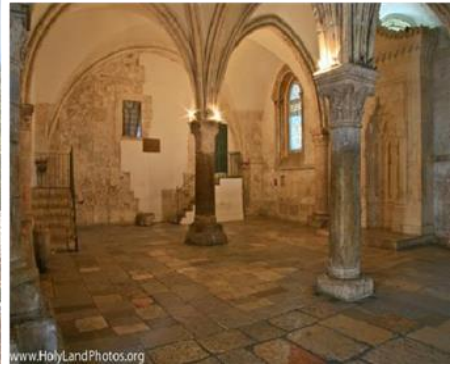
The upper room