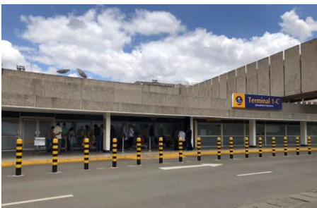
JKIA -Terminal 1-C