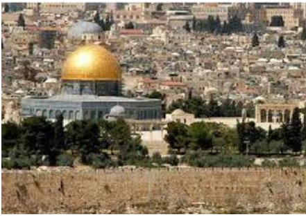
Dome of the rock