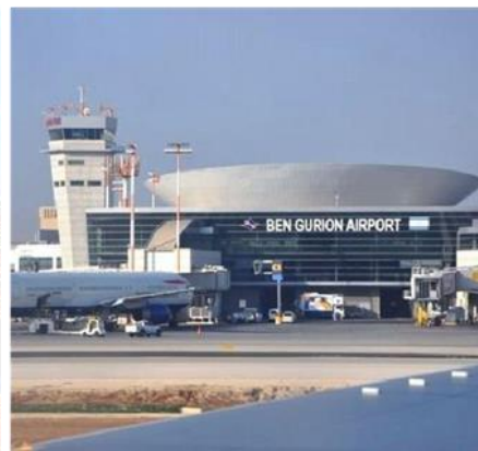
Ben Gurion Airport