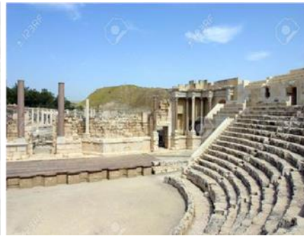
Roman city of Caesarea