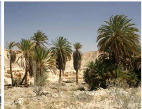
Elim (70 palm trees)