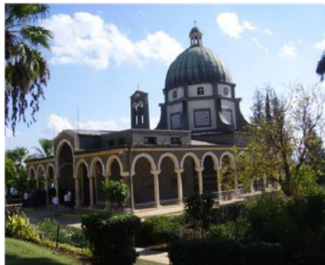
Mount of beatitudes